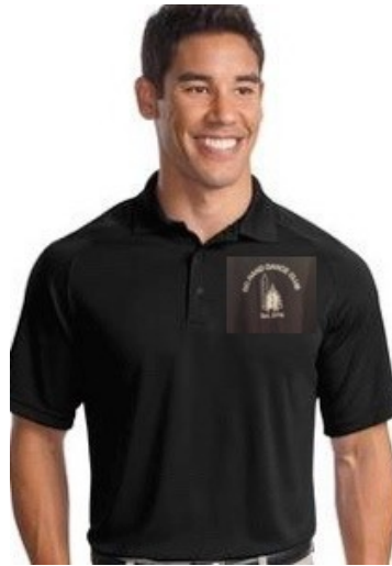
T475 Mens Sport-Tek Dry Zone Shirt. Colors: black, red, royal, white, gold, purple, navy, maroon, green. Size/Price: S-XL $30.50; 2XL-3XL $34.75.