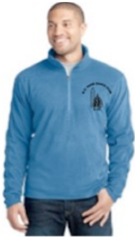
NEW! F224 Men's microfleece 1/2 zip pullover available in light royal, pearl grey, true navy, black. XS-XL $34.25; 2XL $36.25; 3XL $39.50.