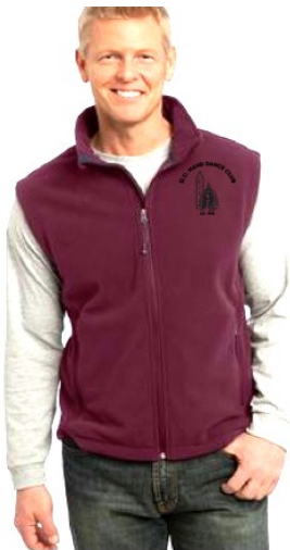
F219 Mens fleece vest with bungee cord zipper pulls, front and interior pockets, open hem with drawcord. Colors: black, dark chocolate, forest green, iron grey, maroon, true navy, true red, true royal. Size/Price: S-XL $36.25; 2XL-3XL $40.50.