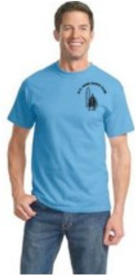
PC61 Mens T-Shirt, 100% cotton. Colors: jet black, white, orange, athletic heather, gold, stonewashed blue, navy, pistachio, lime, sand. (Thirty colors available.) Size/Price: S-XL $15.75; 2XL-3XL $20.25. (Long sleeved is available in 25 colors. Price: S-XL $20; 2XL-3XL $25.25.)