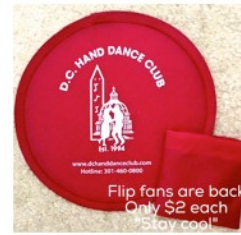
Club Logo Hand Fans: $2 each