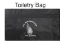
Club Logo Bags: $2 each

Gift Certificates Now Available for Purchase