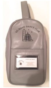
Club Logo Shoe Bags: $8 each