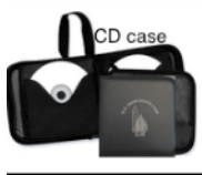
Club Logo CD cases with CD: $3 each