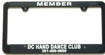
Club Logo License Plates: 2/$1