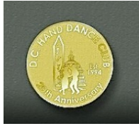
Club 20th Anniversary Lapel Pin: $3 each