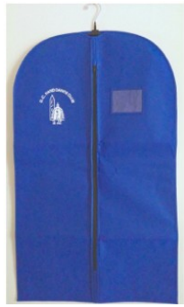
Club Logo Garment Bag: $8 each