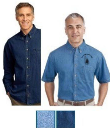
SP10 (long sleeve) & SP11 (short sleeve). Denim Shirt for men. Generous cut and soft garment washing in faded blue and ink blue. Size/Price for short & long sleeve: S-XL $29.75; 2XL $32; 3XL $34.