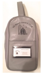
Club Logo Shoe Bags: $ 8 each