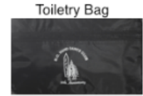
Club Logo Bags: $2 each

Gift Certificates Now Available for Purchase