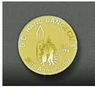
Club 20th Anniversary Lapel Pin: $3 each